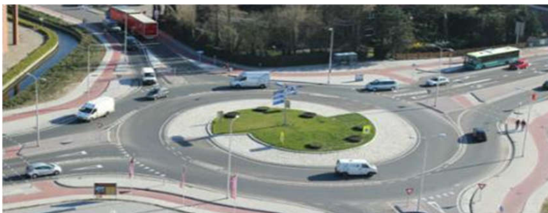
Fig.2. Turbo Roundabout

The design of turbo roundabout is based on requirement of motorcade. The commanding flow of traffic should be kept in mind while designing it. Raised splitters on turbo roundabout compel the motorist to follow the correct lane and thus stay on paths with smaller radii at slower speeds. The geometrical features of the roundabout must include least deviation extent, velocity management, least conflicts and secure operation. Two main