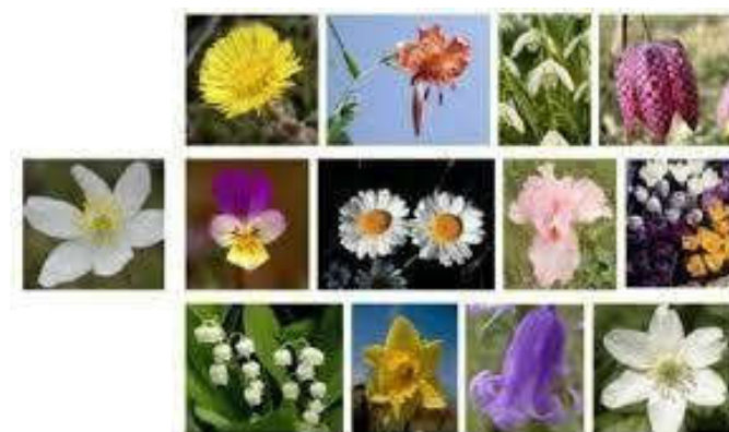
Fig 2: Sample Images from database

Neurons in a fully connected layer have connections to all activations in the previous layer, as seen in regular neural networks. Their activations can hence be computed with a matrix multiplication followed by a bias offset.