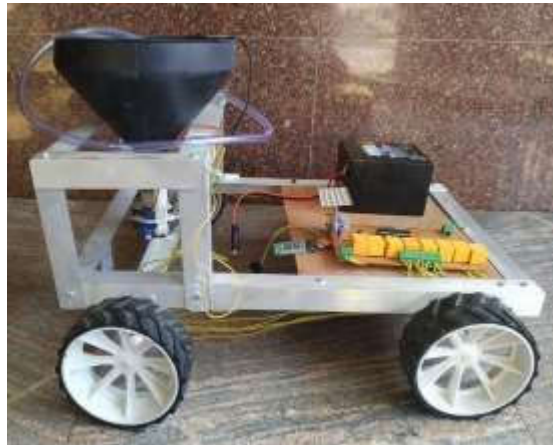
Fig 2. Image of the product