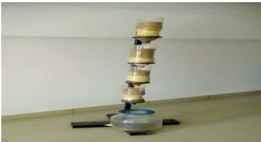
Figure 1: Experimental model

METHODOLOGY: The study was carried out in an experimental setup of filtration media in a vertical stand with 4 bottle compartments. Each bottle compartment consists of filtration materials depending upon larger to smaller voids (R.A. More & S.K. Dubey 2014). At top most layer laterite soil grains of about sieve size passing from 4.75mm and retaining in 1.18mm is filled in bottle compartment. In second most layer rice husk is placed for better adsorption of dairy wastewater. In next layer powdered orange peel and groundnut shell is placed as it is finer media it efficiently adsorbs the wastewater. Between each layer filter paper is provided likewise 4 compartments are prepared and fitted in vertical stand. In bottom water can is provided to collect the waste water passing from filtration media which is considered to be treated waste water from low cost adsorbents. Collected water is tested and replaced in preparation of concrete moulds using M20 mix design.